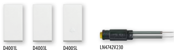
D4001L D4003L D4005L LN4742V230