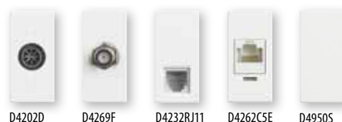
D4202D D4269F D4232RJ11 D4262C5E D4950S