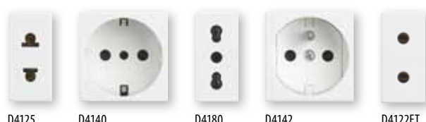
D4125 D4140 D4180 D4142 D4122ET