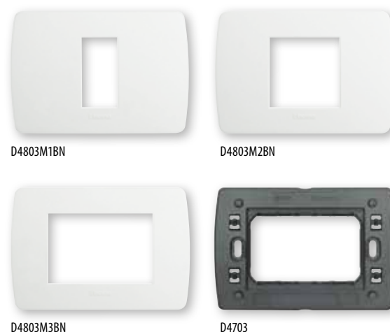
D4803M1BN D4803M2BN D4803M3BN D4703